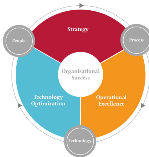
Figure 1: People, Process and Technology

Given this rapidly changing environment, the organization's ability to succeed in this new era will depend on how well they are able to transform and reinvent themselves. The three most significant factors that will drive and guide this change agenda are people, process, and technology.