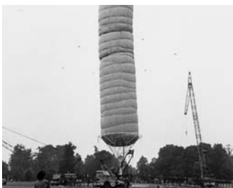
1968 At the documenta fair in Kassel, Germany, Christo and Jeanne-Claude show an 82-meter air-filled fabric pillar.