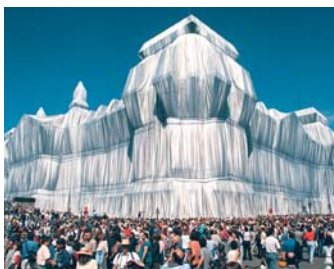
1995 After 24 years in the making, the couple finally get to wrap the Berlin Reichstag.