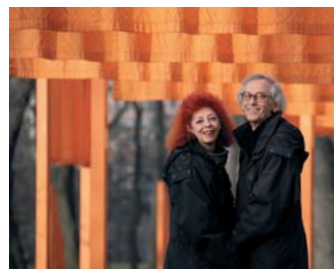
2005 The artists celebrate the opening of The Gates in Central Park.

1935 Christo Javacheff and Jeanne-Claude de Guillebon are both born on 13 June: Christo in Gabrovo, Bulgaria; Jeanne-Claude in Casablanca, Morocco, of a French family.